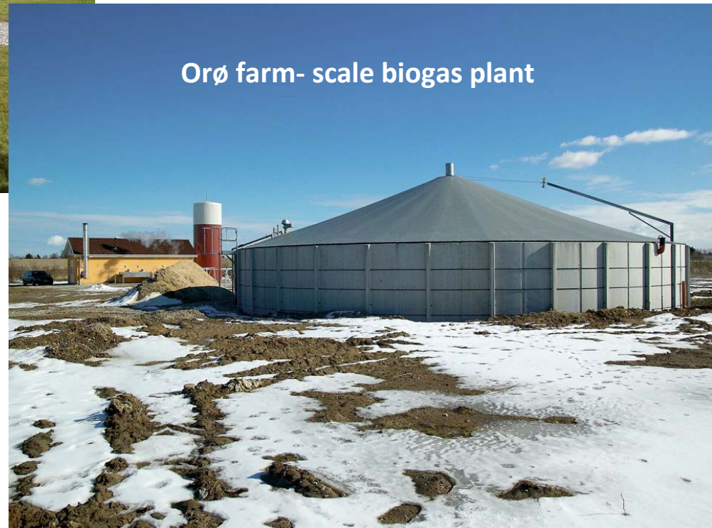
Orø farm- scale biogas plant